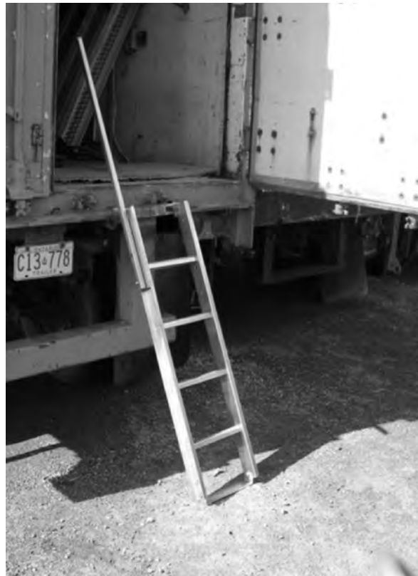
Figure 30-5: Use a Ladder to Access Work Locations