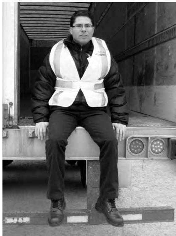
Figure 30-7: Reduce Impact Force by Sitting on the Edge Before Jumping