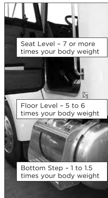
Figure 30-2: How Height of Jump Affects Impact Force'

As demonstrated in Figure 30-2, the impact force of jumping from the bottom step of a truck compared with jumping from the floor level or seat level can increase from 1 - 1.5 times your body weight to 5 - 7 times your body weight. The impact force will also increase if the landing area contains a hard surface or is in a tight space compared to if it contains soft soil, mats or foams that allow the impact force to dissipate.