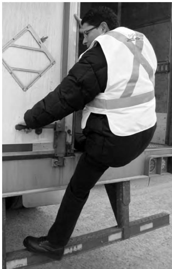
Figure 30-6: Three-Point Contact